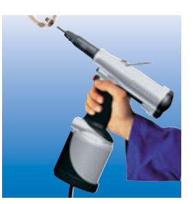
P2005 for setting by stroken M3–M12