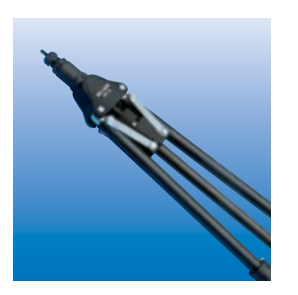
Range of manual installation tools

There exists a relationship between the levels of quality, speed and cost to achieve an optimised installation process and for this reason BÖLLHOFF produces a wide range of assembly solutions to suit your application. Please contact us for advice on the ideal choice of equipment.