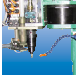
Automatic and semiautomatic setting