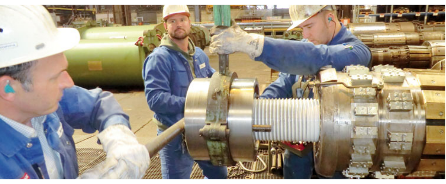
The HELICOIL® thread insert is screwed on